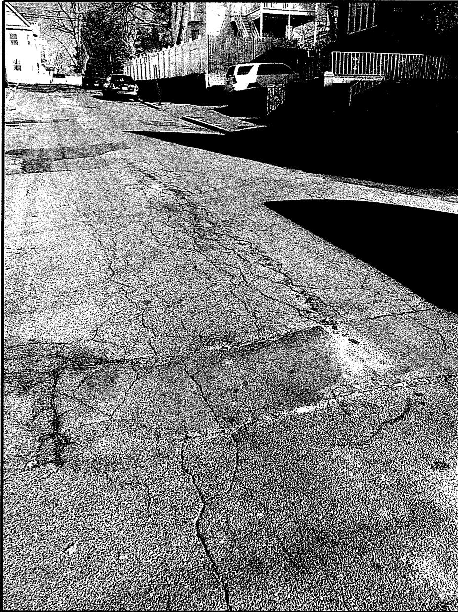
Photo shows existing pavement repairs and typical cracking. Some settlement of curbing shown as well as a poor section of sidewalk.

Towards the top of the street looking north towards Mountain Ave.