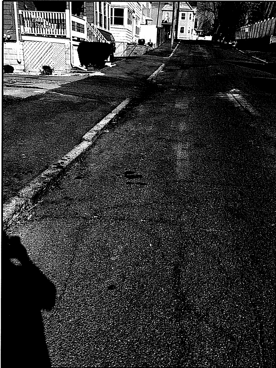
Photo shows some curb settlement but curb is mostly in decent condition.

Mid-Block looking north towards Mountain Ave.