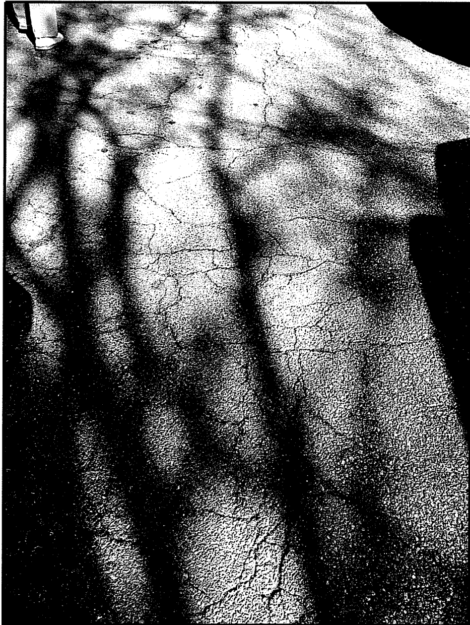
Photo showing typical roadway cracking