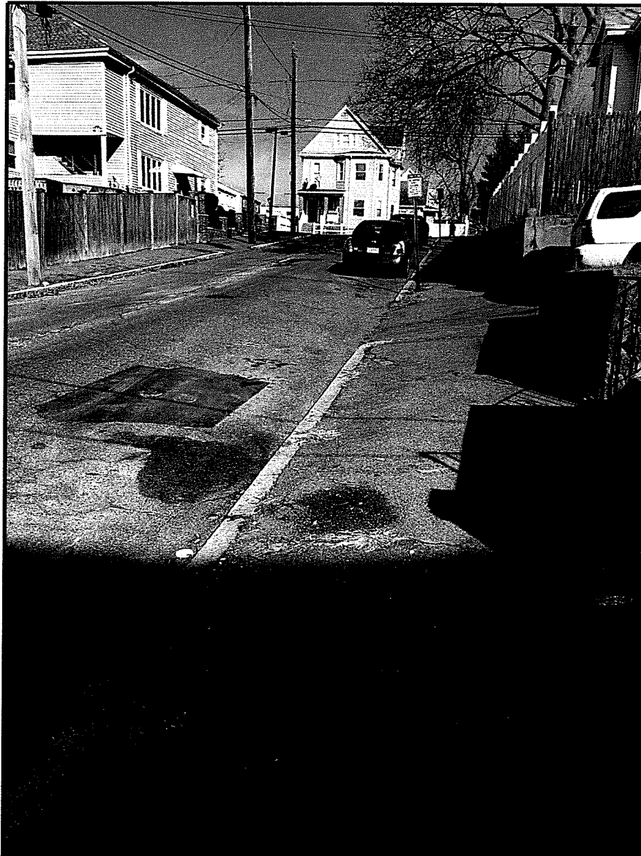
Photo highlighting poor section of sidewalk. Curb doesn't have 6" of reveal but in decent condition.

Towards the top of the street looking north towards Mountain Ave.