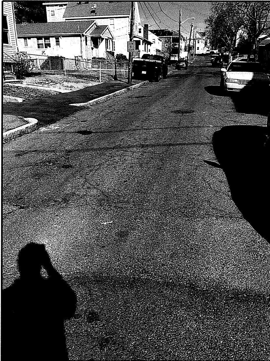
Photo shows typical condition of roadway, curb and sidewalks

Mid-Block looking north towards Mountain Ave.