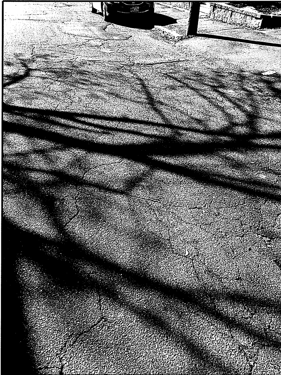
Photo shows alligator cracking of street and vehicles parked on sidewalk

Mid-Block looking north towards Mountain Ave.