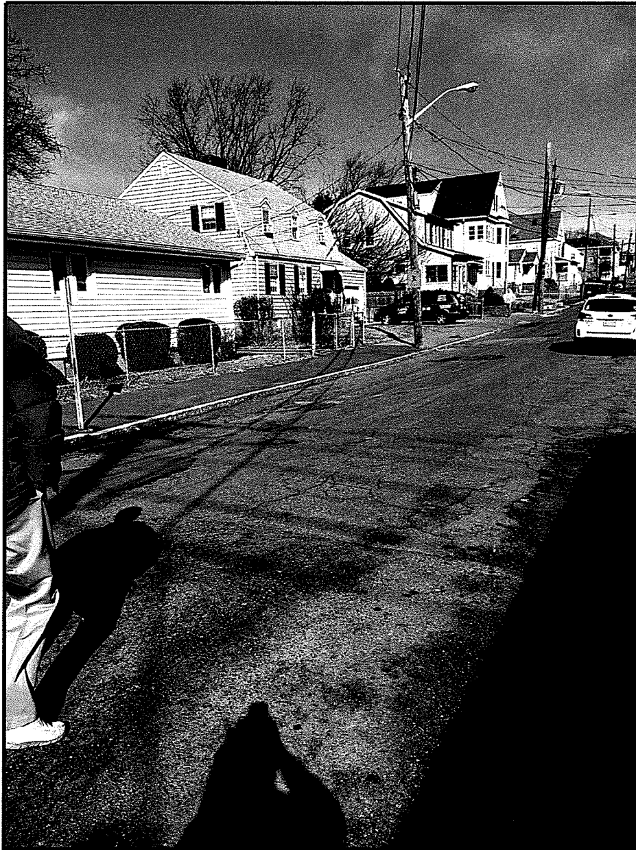
Photo shows poor condition of pavement but decent condition of granite curb and asphalt sidewalks.